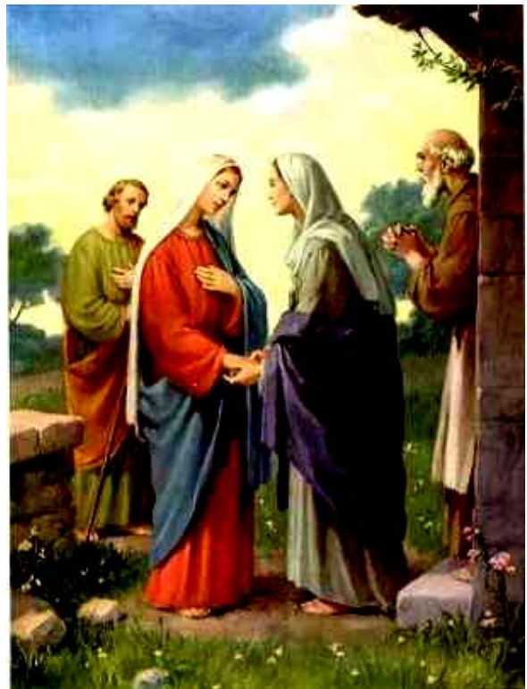
VISITATION OF MARY